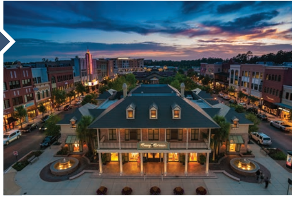
THE WOODLANDS WATERWAY