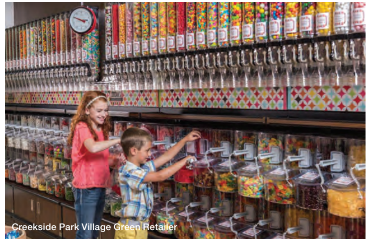
Creekside Park Village Green Retailer