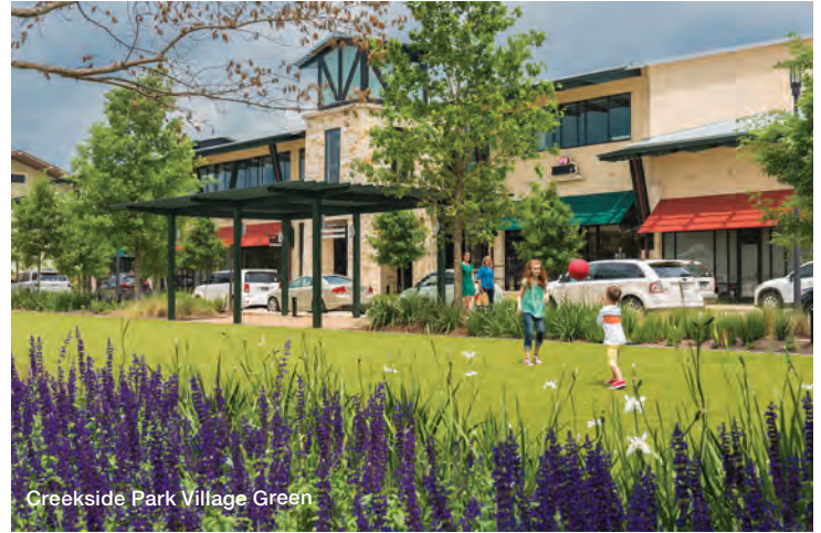
Creekside Park Village Green