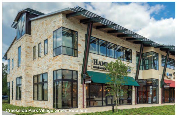
Creekside Park Village Green Retailers